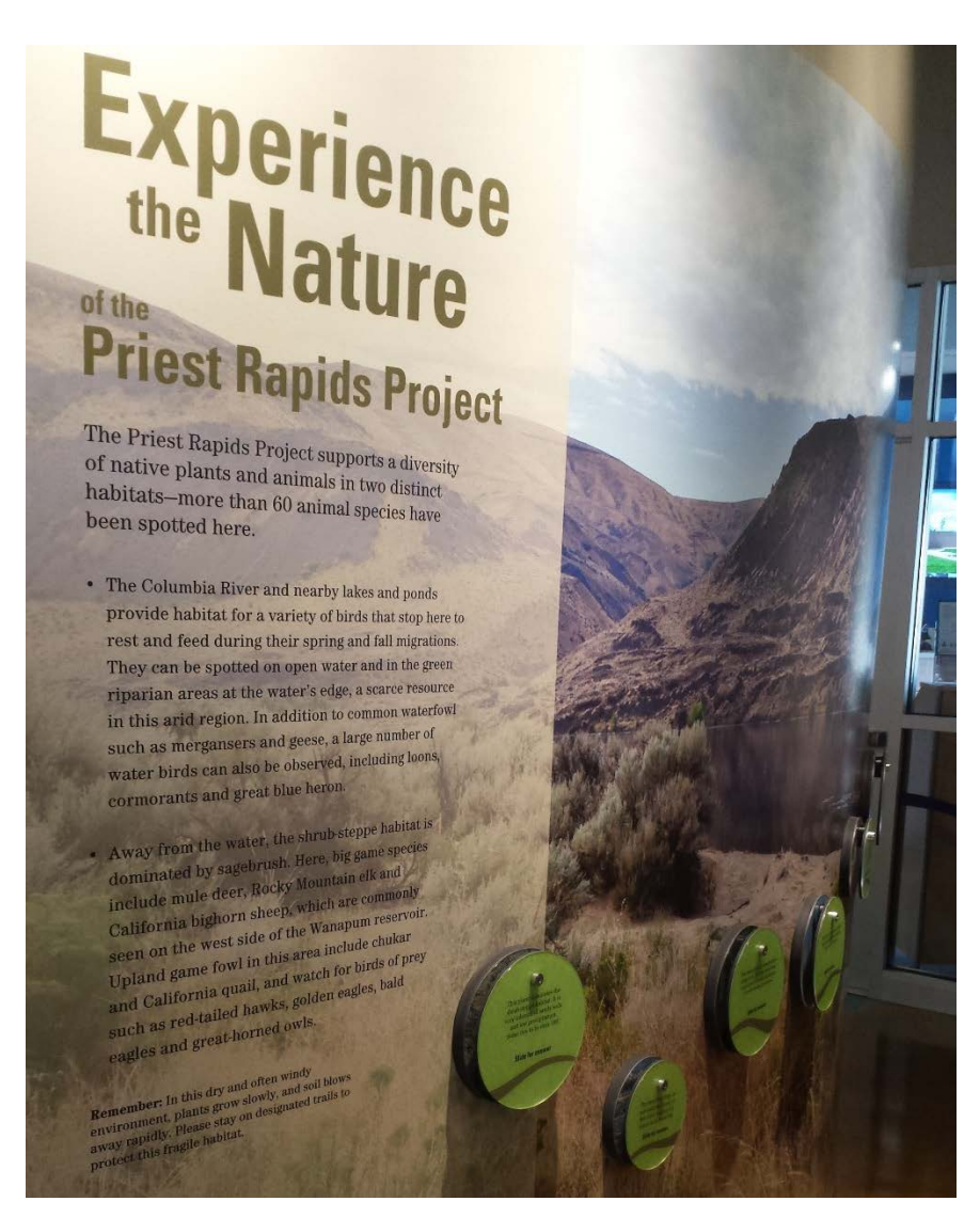
Figure 4 Habitat Information at the Visitor Center.

As of December of 2018, over 3,000 people visited Grant PUD's Visitor Center located in the Hydro Operations Building (HOB) at Wanapum Dam. Visitors are able to experience a number of wildlife and wildlife habitat interpretative elements on display throughout the exhibit that illustrate the importance of maintaining a healthy ecosystem and promotes responsible recreation practices (Figure 4). Visitors can also learn where each of the recreation sites are located throughout the Project and what amenities are present (Figure 5).