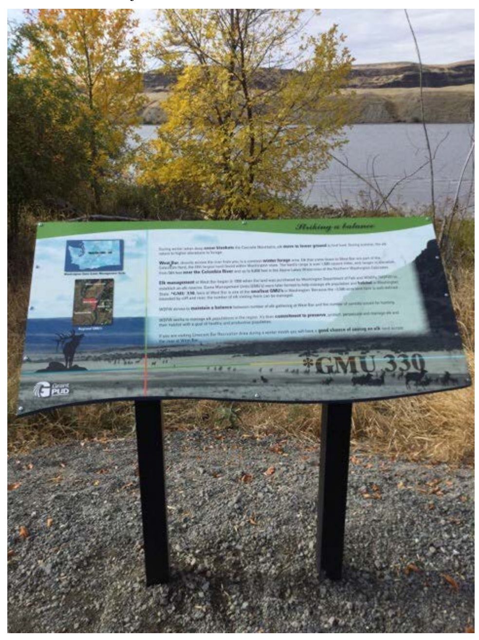
Figure 3 Wildlife informational sign at Crescent Bar Recreation Area.

In addition to the website, Grant PUD's Environmental Affairs department has collaboratively developed posters and signage to educate the public on the importance of responsible recreation throughout the Project. There have been numerous kiosks and wildlife-specific signage installed and maintained in 2018 at Grant PUD recreation sites and boat launches throughout the Project (Figure 3). In 2019, Grant PUD looks to continue development and installation of additional signs and kiosks within the Project.