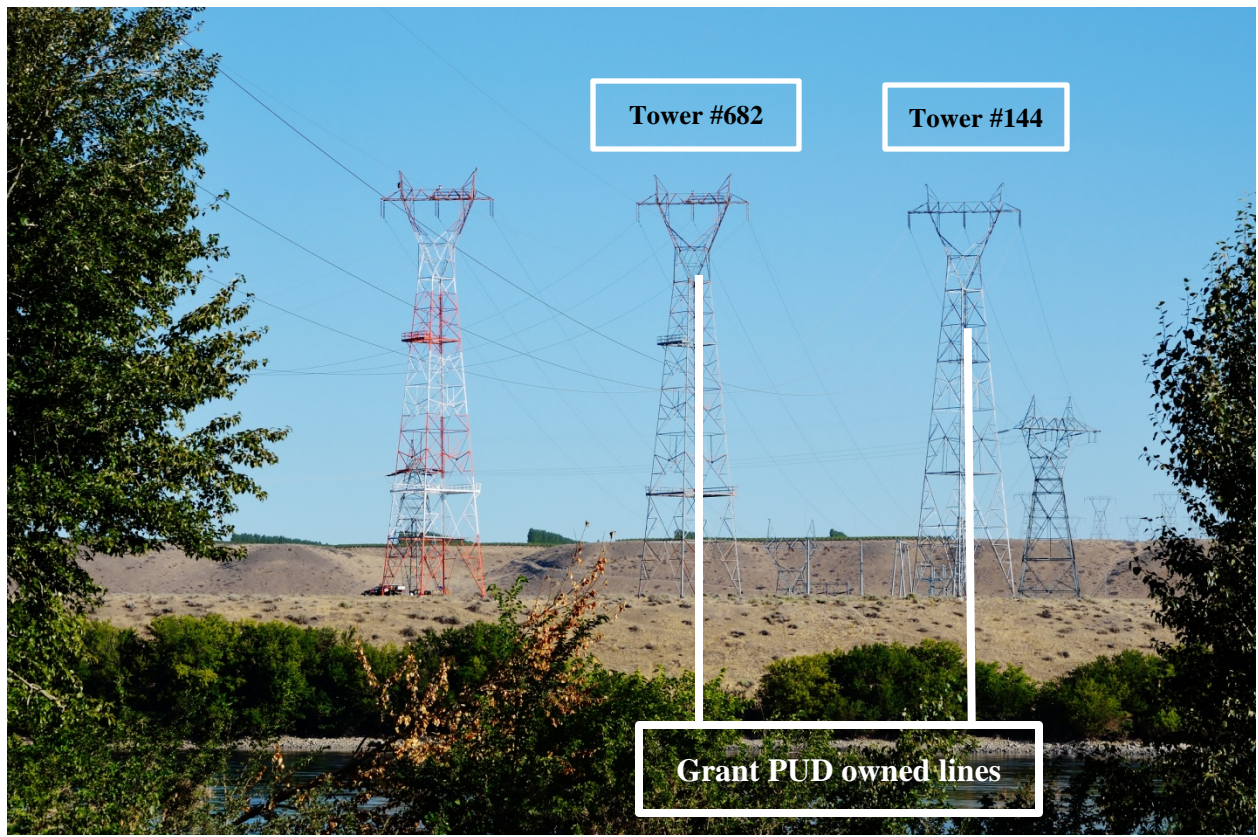
Figure 3 The three-span transmission line cluster at Midway with Midway – Frenchman Hills 230kV line between Structures #681 and #682 and Priest Rapids – Midway 230kV Line #2 between Structures #144 and #145 identified.